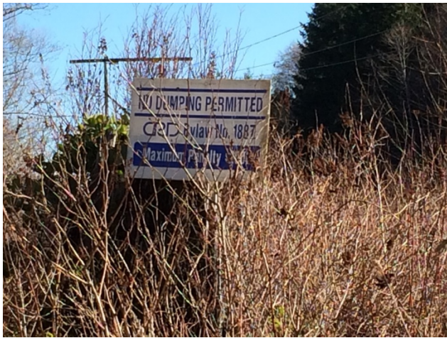
Old CRD “no dumping” sign by Damamiel Creek east of Young Lake Road

OPSRRA, as a community organization, has also been invited by the CRD Director to put in a request for grant funding to the CRD in order to conduct a cleanup of some of these illegal dumping sites this spring. As your Board has limited resources, we are requesting that anyone who would like to become involved and help organize this cleanup event to send us by email at opsrra@gmail.com .