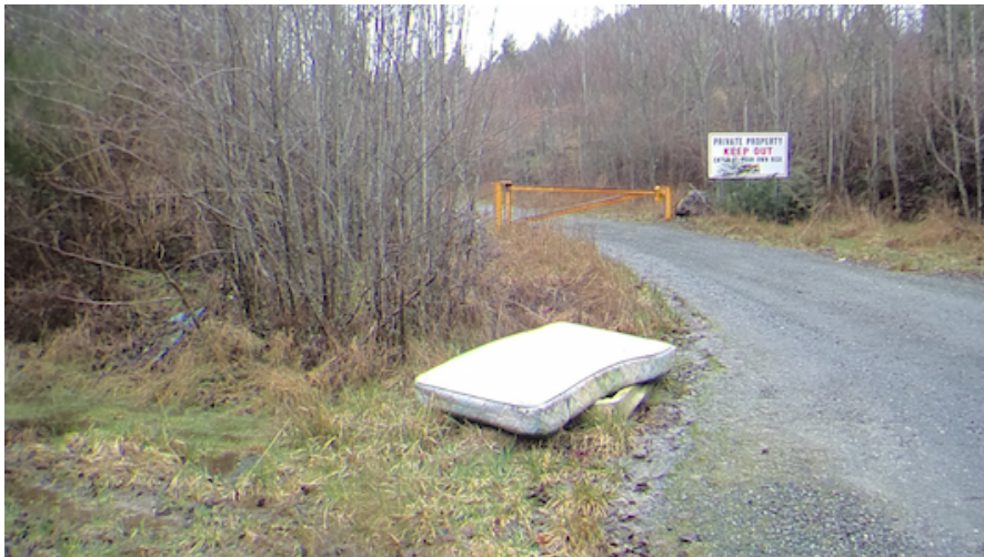
Abandoned mattresses at Cedar Coast Drive on West Coast Road.

The worst sites identified as priorities for signage included four sites in Otter Point, including Demamiel Creek along a private road running east of the five-way intersection of Butler, Poirier and Young Lake Roads; and seven sites in Shirley and Jordan River, including Muir Creek Bridge along West Coast Road (Shirley) and Fore Bay Road (Jordan River). An old, small CRD “no dumping” sign was also identified along the private road by Demamiel Creek in Otter Point which also required replacing.