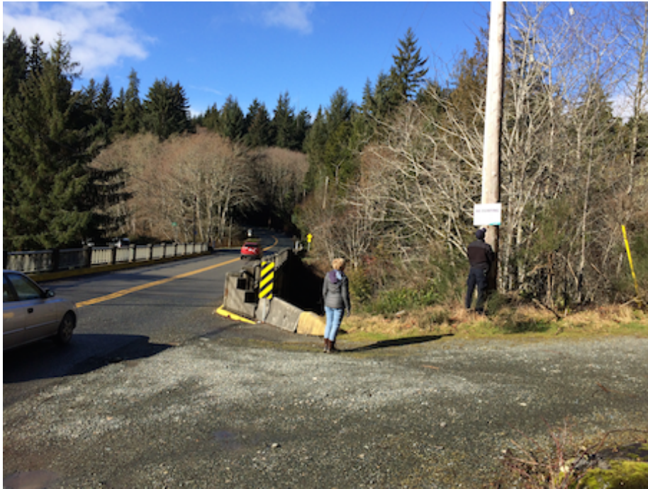
Posting a new CRD “No Dumping” sign at Muir Creek Bridge