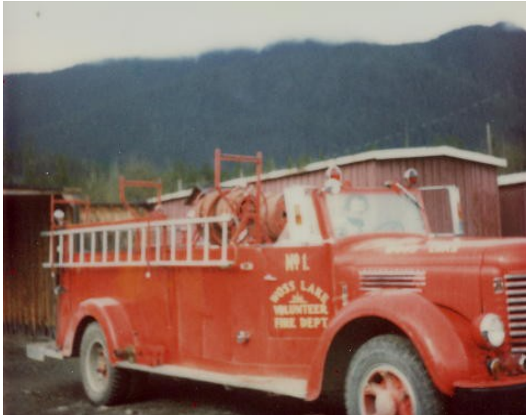
The first fire truck as it looked when in use by the Woss Volunteer Fire Department.

The fire department's first "fire truck" was a 1956, one ton Dodge flatbed truck. It came into service in October, 1977, and was equipped with a 250-gallon water tank, three pumps and storage lockers for equipment and gear.