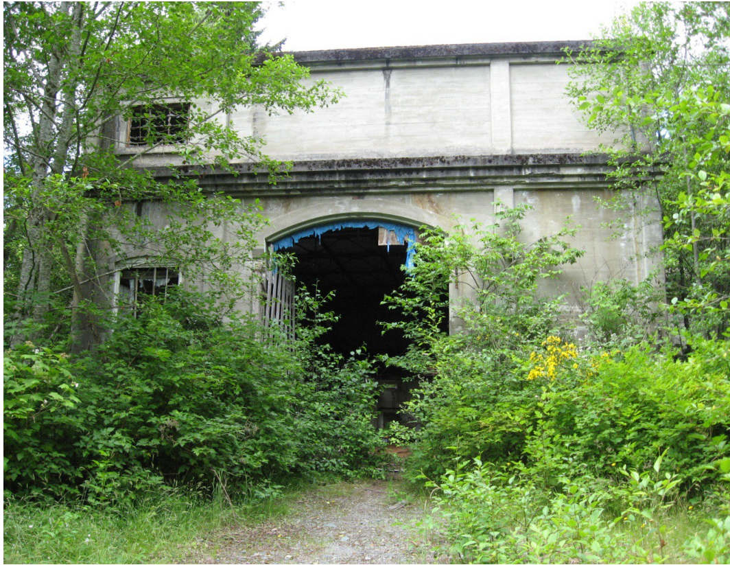
A view of the east end of the old Jordan River Power House. The building is located on the east side of River Jordan, behind what used to be the Western Forest Products work yard. Photo taken June 2014 by Arnie Campbell.

Last month's picture was correctly identified as the old Jordan River Power House by Chris Cole and Bud Gibbons.