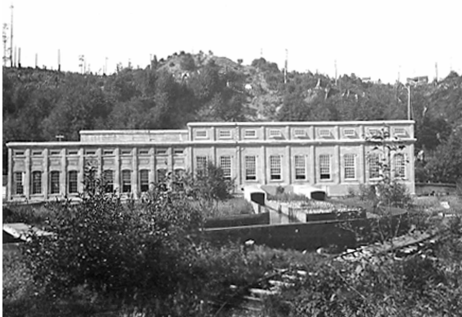
The Jordan River Power House c 1926, Sooke Region Historical Society archives.